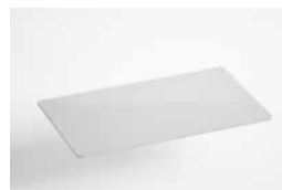
Modo Cover Tray

HPL vessel basin ?? - specify finish/color: HPL 19-5/8" W, 13" D, 5-1/2" H no overflow **Available finishes: Ardesia (TKF), Pulpis Chiaro (TKH), Pulpis Scuro (TKJ)